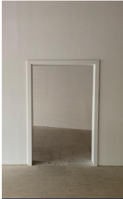
OPENING BETWEEN SPACES 3962 & 3964